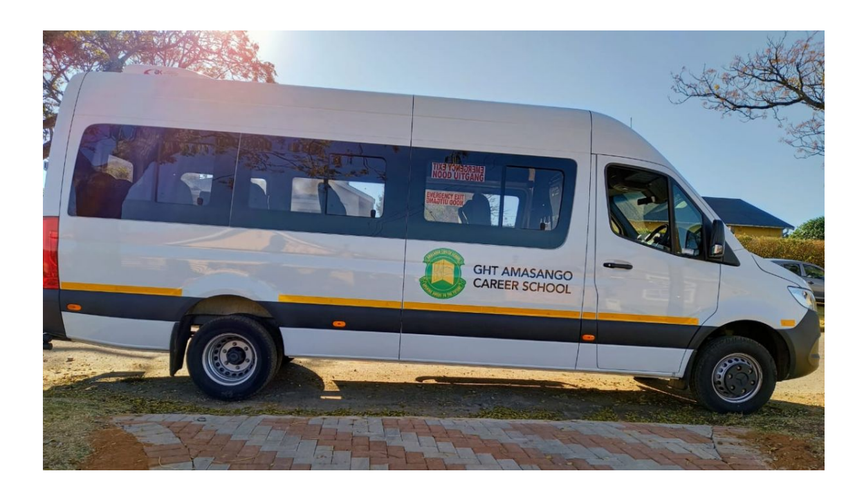
In the UK we would normally be busy putting the final touches to Linda's UK fundraising tour but, for obvious reasons, she will not be coming. However, we