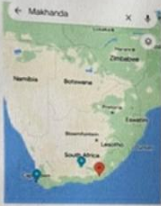
The red pin is where we are in South Africa.