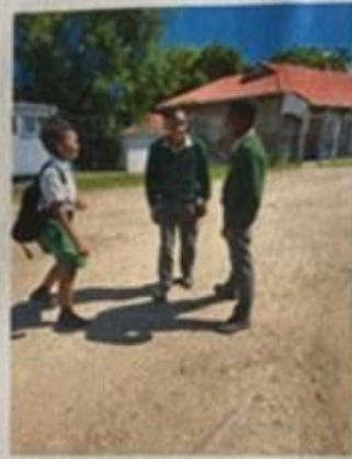
This is Amasango. The name means gates (open gates.)