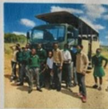
There are many game parks nearby. We enjoy going to Shamwari.