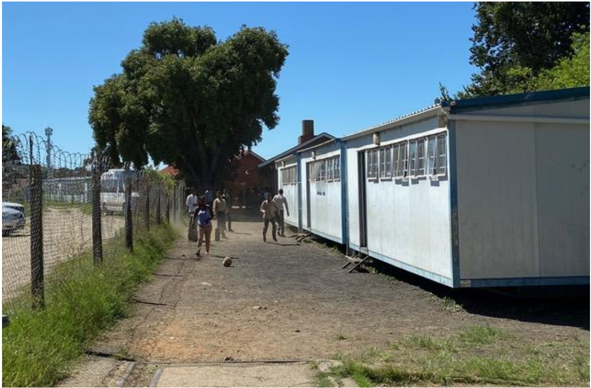
Amasango in the glorious summer sunshine. Students play football on the small area available to them. Plans are finally coming into place to move the school to a much more suitable site - we will keep you up to date.