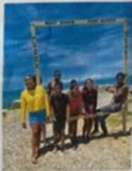
The beach is one hour away. We swim and braai (barbeque) there at the end of the year.