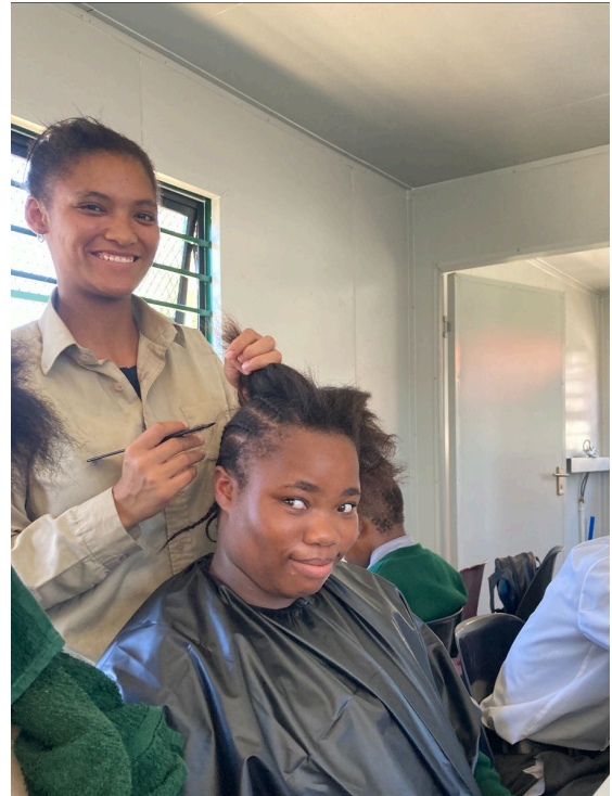
The Salon, paid for in part by the Friends of Amasango, is busy with students learning their trade.